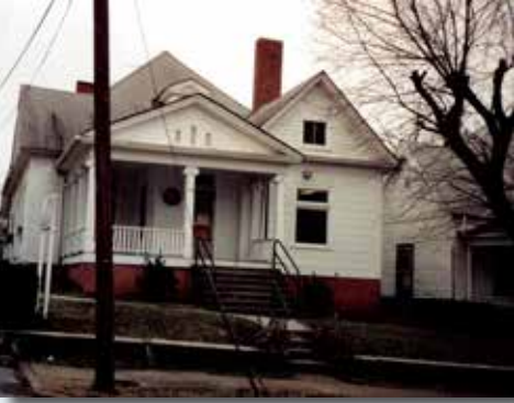
The first Refuge located on Hinton Ave.

As a result of the “Housing First” approach, over 966 individuals experiencing homelessness have achieved housing with 93.8% of those maintaining housing for a year or longer. VMC will celebrate the 1000th person overcoming homelessness and moving from the streets to a home of their own in 2018!