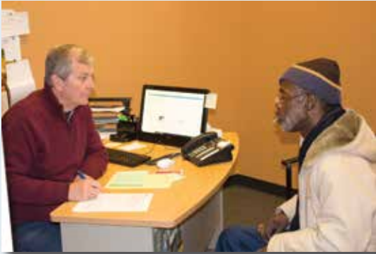
Refuge volunteers provide assistance to prevent homelessness.

Staffed primarily by trained volunteers, the Refuge sees individuals and families who are at risk of losing their housing. It provides counseling and case management that can lead to housing sustainability. Additionally, the Refuge can help with procuring birth certificates and state-issued identification, prescription medications, clothing, furniture, etc. It also makes referrals to other agencies and services as appropriate. Each individual is seen in a private interview setting and confidentiality is maintained.