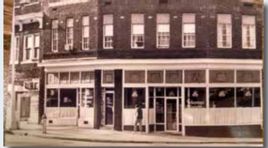
VMC's old building on Gay Street.