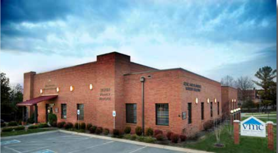
VMC's current location on Broadway.