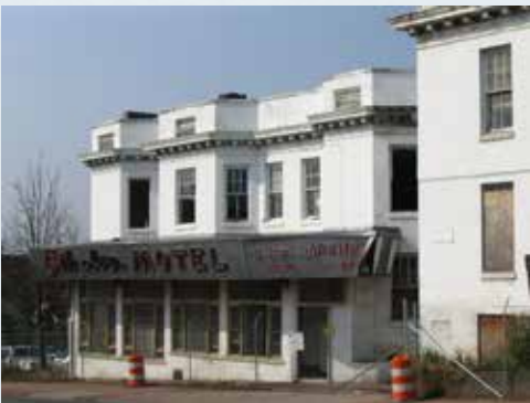
The old 5th Avenue Motel (now Minvilla Manor) at the corner of Broadway and 5th Avenue.