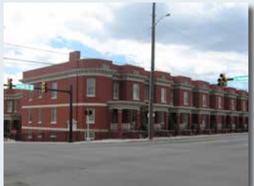
Minvilla Manor (formerly the 5th Ave. Motel) which is on the National Historic Register.