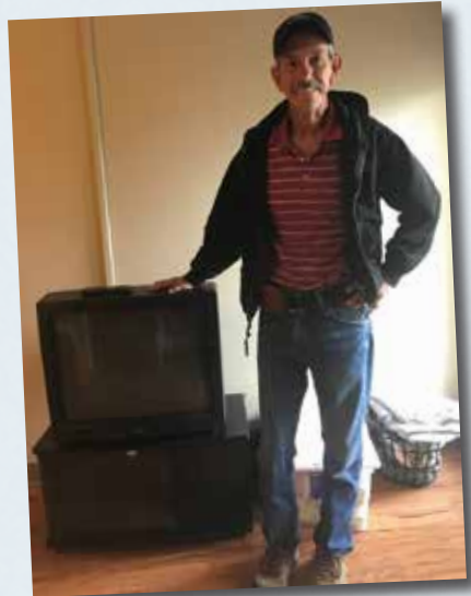
Move in day always brings smiles when you are no longer homeless.