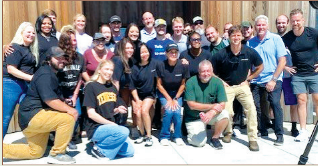
The Dominion Group transformed the Bush Family Refuge into a bright and cheery space by painting all of the offices, hallway, and entrance. Dominion provided the paint and the labor for this project which involved cleaning the walls, filling holes, priming the walls and painting. THANK YOU, DOMINION!!