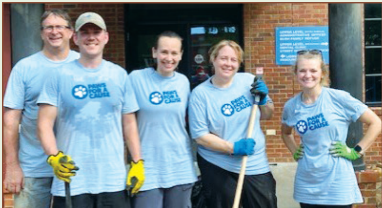
A Day of Service by PetSafe significantly improved the landscaping at VMC's main entrance. Rock was removed and weeds were pulled before laying sheets of weed barrier and replacing the rock. THANK YOU, PETSAFE!!