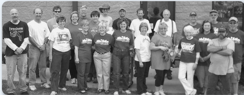
Operation Inasmuch Work Day Crew

Operation Inasmuch. At day's end, fresh mulch lined the building and budding greenery gave a face lift to our grounds. Our thanks go to the volunteers from Central Baptist of Fountain City, Fountain City Presbyterian and Fountain City United Methodist.